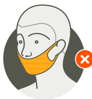
Not covering nose