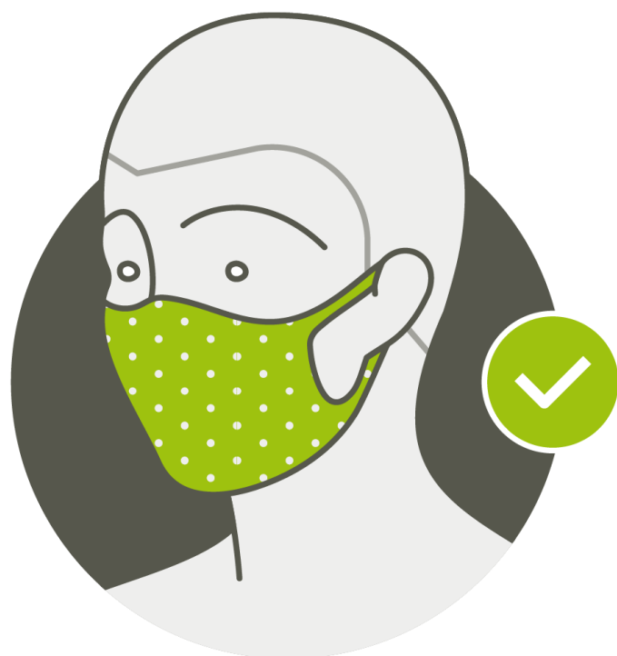
Proper fit from bridge of nose to under chin