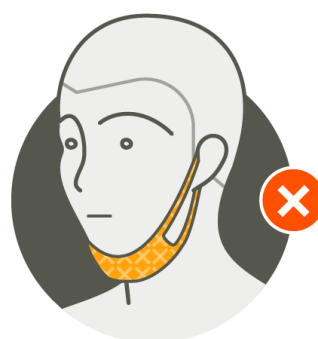
Mask should be all on or all off